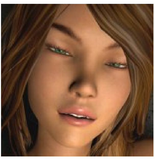
Video Games You Should Never Play in Front of Your Kids