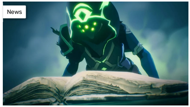
Spellbreak Arrives on Steam Tomorrow, Details Future Plans