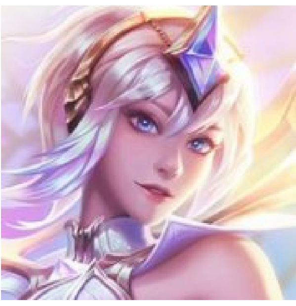
Riot Explains Why They Will Never Make a Skin Like This Again