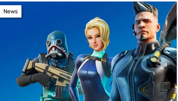
Fortnite Performance Mode Will Boost FPS on PC