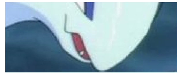
This Majorly Important Pokemon Game Just Had Its 20th Birthday