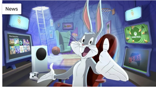
Xbox Wants Your Help to Make a Space Jam Game