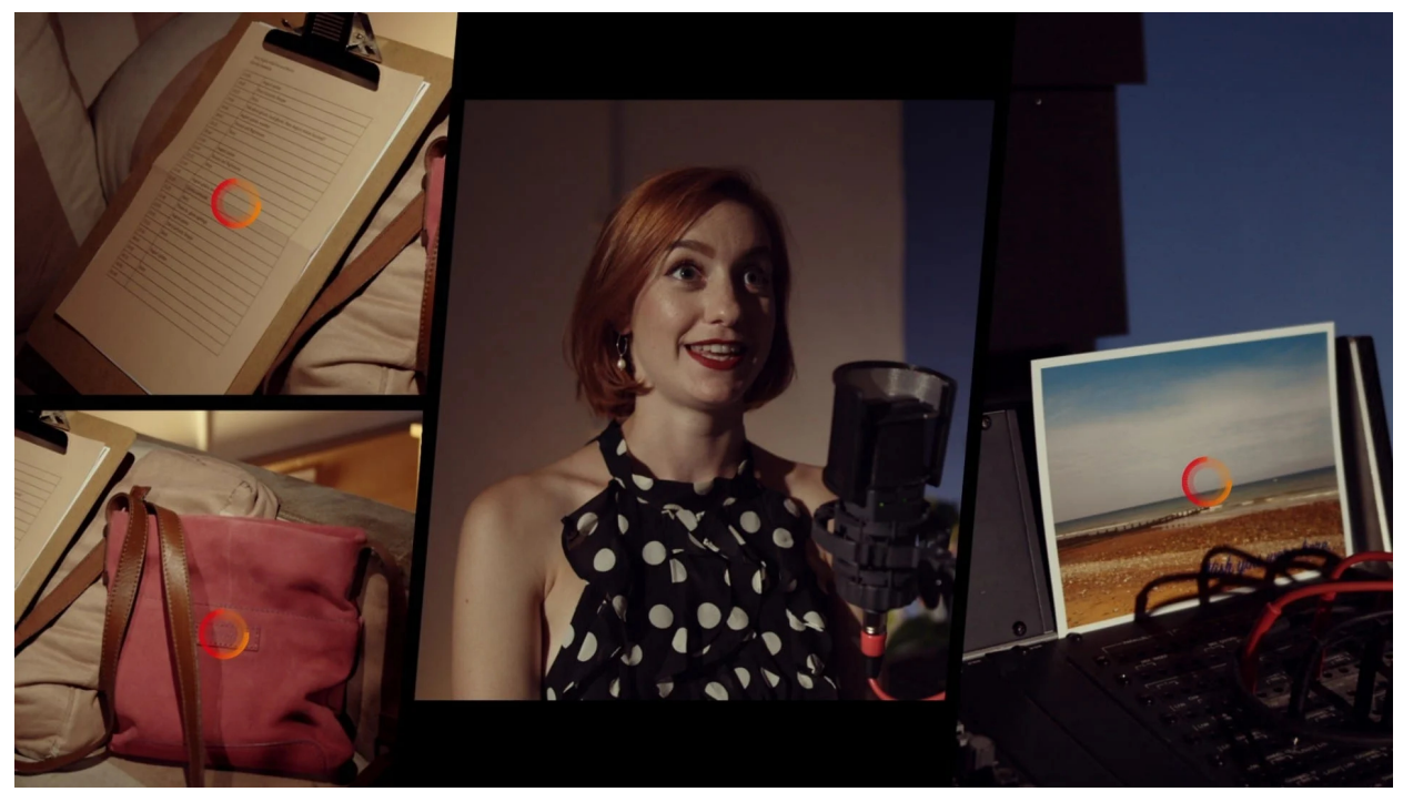
Don't let the timers run out on your choices!

Each episode runs about 20 minutes, and mostly stays self-contained, which is a departure from what you expect from an FMV adventure game. Even Bandersnatch told one continuous storyline over its move-sized length, implementing restarts and rewinds into its overarching plot. Dark Nights runs more like a typical program, a new story each time out with a few recurring elements to hold things together. That structure solves the problem of having to explain replaying sections over and over, but it's not without its own issues.