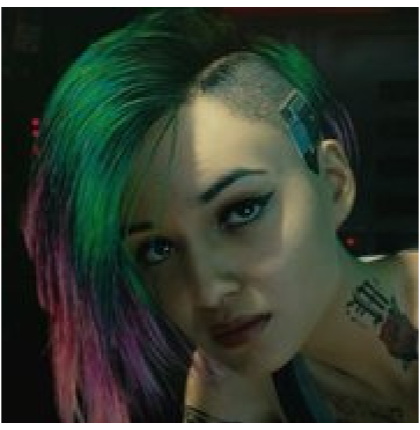
The Cyberpunk 2077 Scenes The Internet Is Out Over