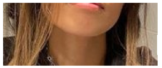
The Truth About Gaming's Fastest Growing Streamer