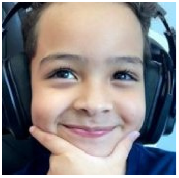
9-Year-Old Professional 'Fortnite' Player Receives Four Year Ban