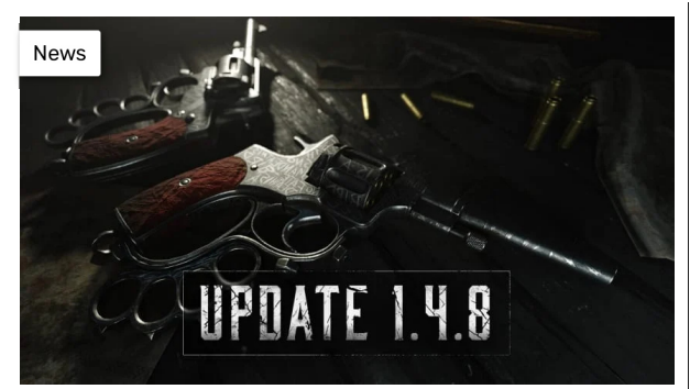
Hunt: Showdown Update 1.4.8 Debuts Watch Towers, New Weapon Variants