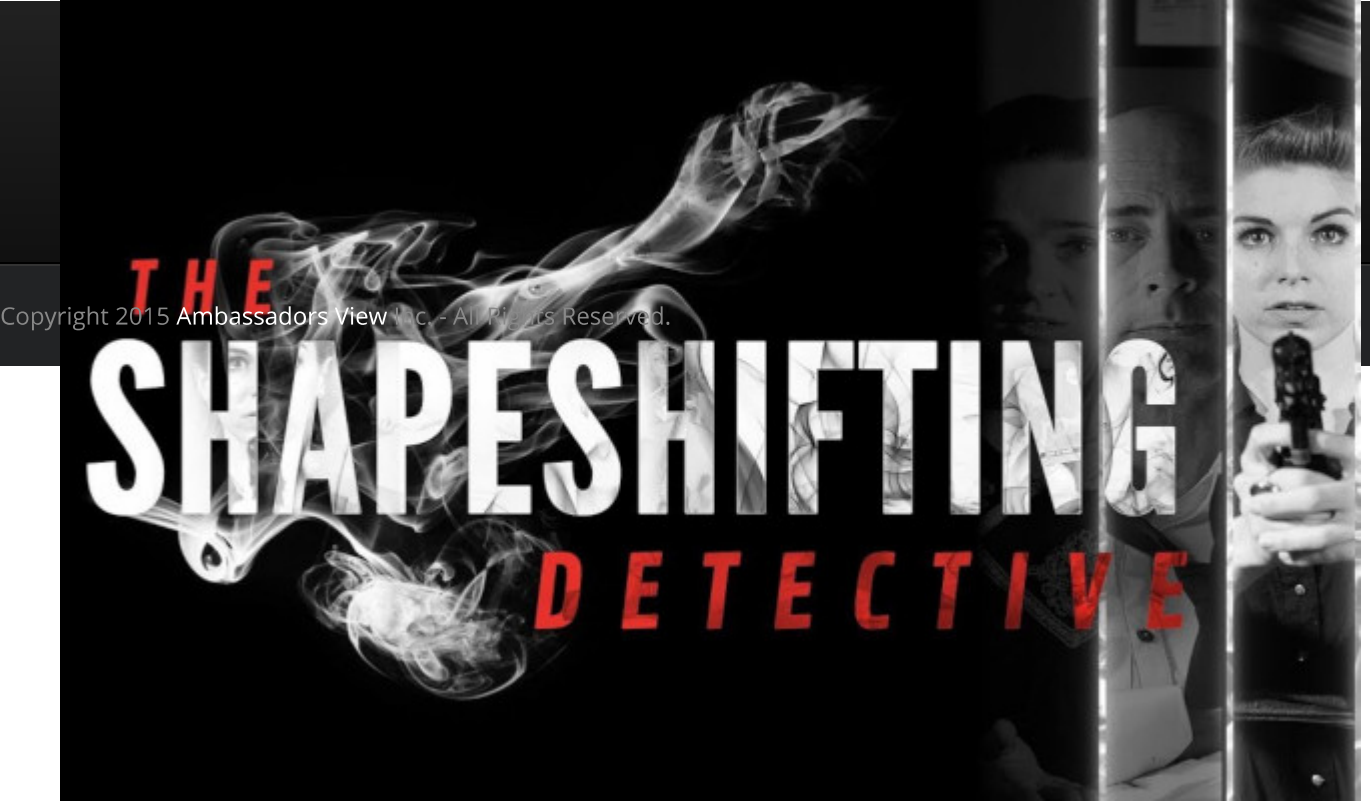
"Solve the murder. Stop the killer. Don't get caught."

There has been a murder in the town of August and it is down to us, a shapeshifting detective called 'Sam', to catch the killer & prevent this tragedy from happening again and it is with those three sentences in mind we begin our investigation into a world like no other in D'Avekkis 'The Shapeshifting Detective'.